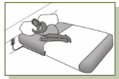
Step 1– Throw used as half-sheet, cross-wise