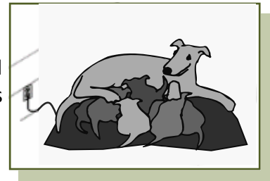
Step 1– Plush pad used as pet-pad